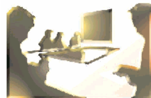
Neighbourhood Learning Centre